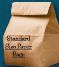
Standard Size Paper Bags