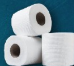
Toilet Paper Rolls