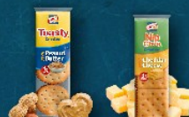
Cheese / Peanut Butter Crackers