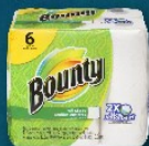
Roll of Paper Towels