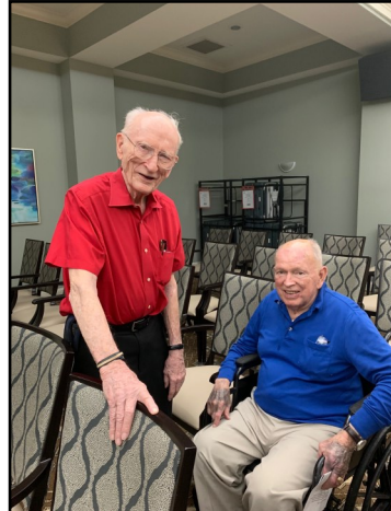
A few pictures from Parkway Place when the choir went over to sing on December 15th.